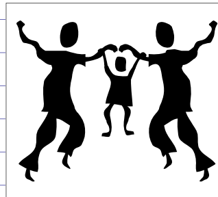
A family that supports each other is a step towards a peaceful world.

time, funds, and good will from people like you to keep them happening. Join us and help us do even more. Visit www.d168.org and click on the PTA tab to print out a membership form and mail in or drop your dues and form at your child's school office.