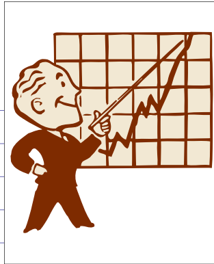
Is your child worth 100?

To date for this school year we have 47 members. This is nice but we are shy of matching last year. My hope is that we work together to pass the 61 that was set last year and reach a goal of 100! CAN YOU IMAGINE if 100 parents joined the PTA this year. We could really have a nice second half of the school year and provide our children with some fun and some educational items to assist the teachers. There has been open involvement with the administration and many ideas have been talked about and some are being worked on right now. Please resolve to be involved